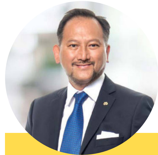
TUNKU YAACOB KHYRA